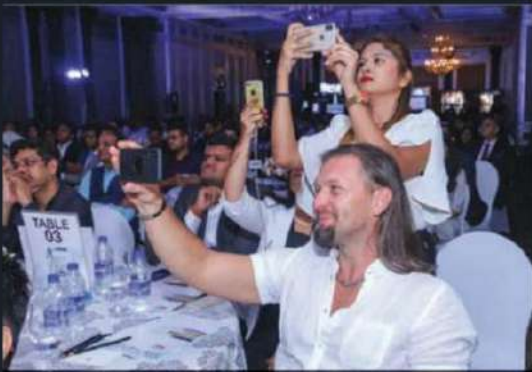
The enthusiastic audience added their own energy to the proceedings.