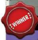
YASHODA HOSPITAL, GHAZIABAD