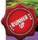
CENTRUM IT PARK, THANE, MUMBAI