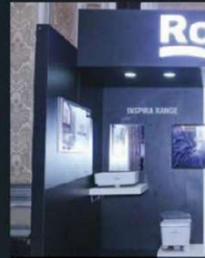
Roca India's products made quite a splash.