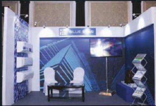
Blue Star's simple yet effective product display.